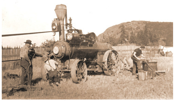
Farm machinery at Tod Farm