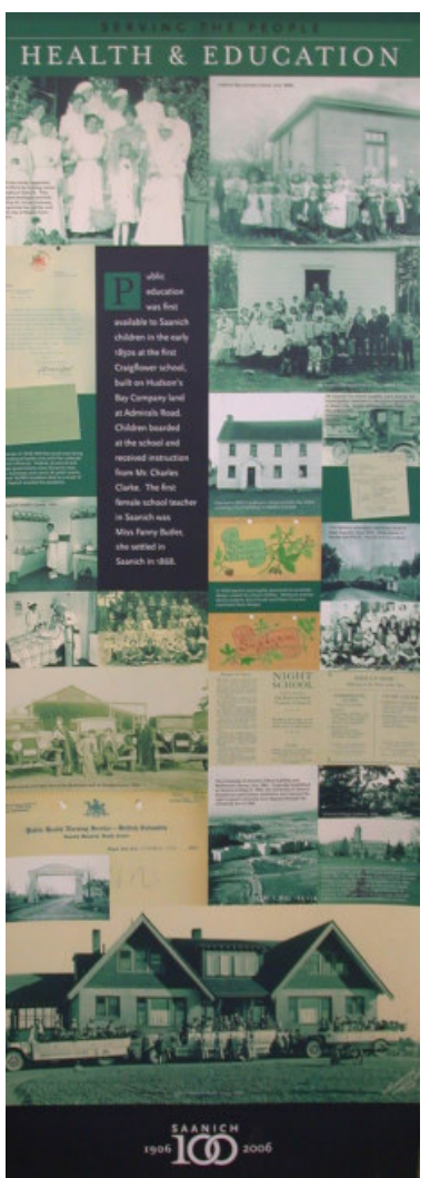
Saanich Heritage Health and Education Display