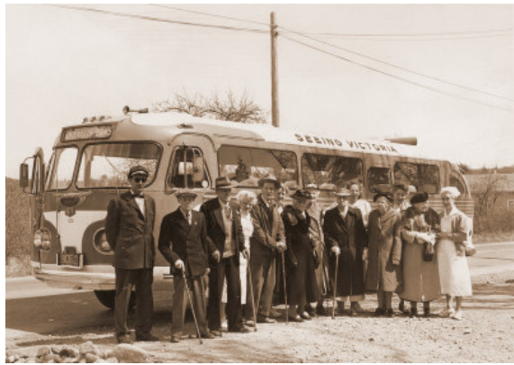
An Outing to the Butchart Gardens Saanich Archives