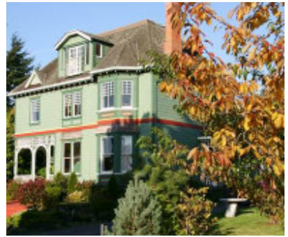
Telegraph Bay Road

In August 2006 a Heritage Sites layer was added to Saanich's GIS Online Mapping System. This resource is available on the Saanich website. This layer shows locations and heritage status of all sites listed in the Saanich Community Heritage Register. There are plans to add photos and building descriptions for each site.