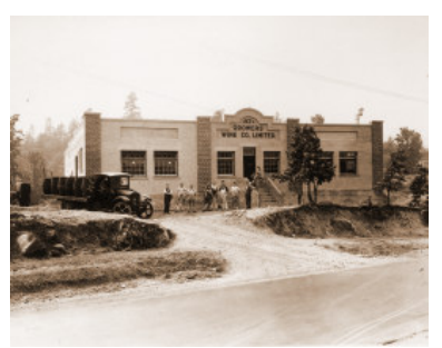
Grower's Wine Company Limited Building and Staff, 1927