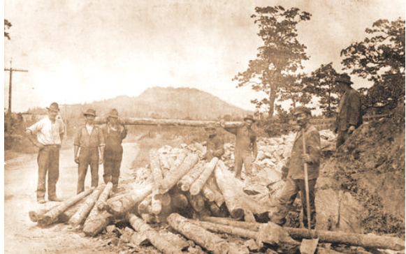
Building of Shelbourne Street through Tod farm c.1915