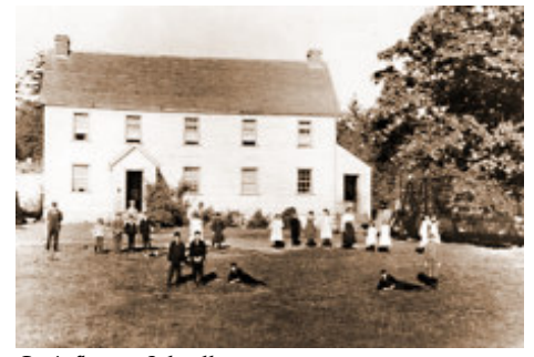
Craigflower Schoolhouse Heritage Branch, BC Provincial Government

The Foundation also supported the Land Conservancy in the maintenance of Craigflower School in Saanich.