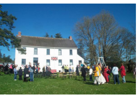
Craigflower Schoolhouse 2005 - Craigflower 150th Anniversary