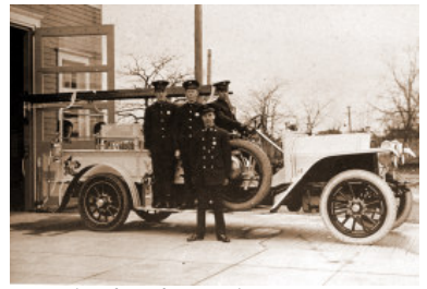
Saanich's first fire truck

Both the Saanich Police Department and the Saanich Fire Department hold and protect their own archives and artifacts.