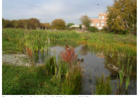
Peer's Creek in the Wilkinson Valley

Conservation of heritage resources also play an important role in creating a Sustainable Environment which is another focus of Saanich's Strategic Plan. Heritage buildings can be recycled for reuse or adaptive reuse. It is prudent to reuse existing resources rather then filling the landfill, and increasing the demand and energy of producing and shipping new building materials.