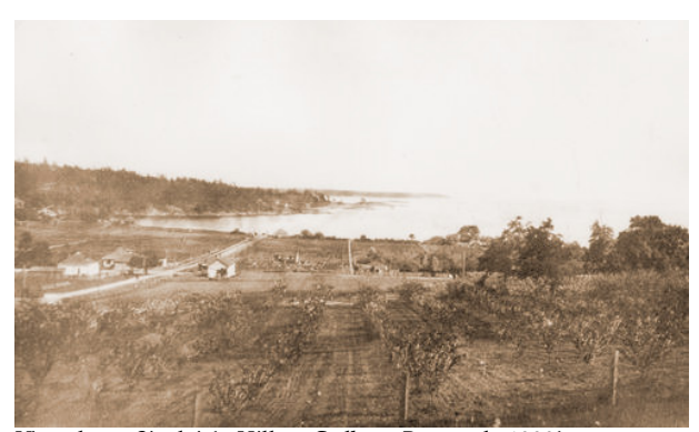
View down Sinclair's Hill to Cadboro Bay, earlt 1900's