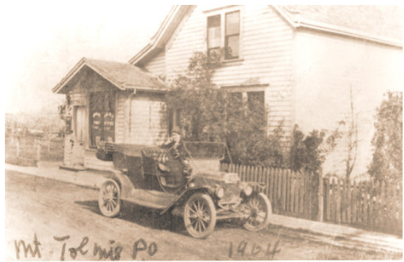
Mt. Tolmie Post Office, Cedar Hill Road, 1904 Saanich Archives