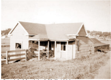
Saanich Municipal Hall 1906

The Saanich Heritage Management Plan, endorsed by Council in 1999, provides the policies and procedures that direct the future management of our heritage resources. The Heritage Action Plan aims to provide specific and attainable action items to implement and fulfill the recommendations and policies of the Management Plan and to support the vision presented in the Saanich Strategic Plan, 2006-2010.